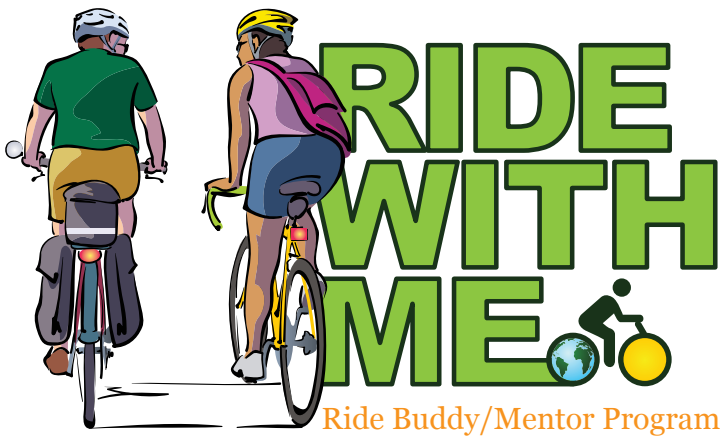
Ride Buddy/Mentor Program

Have you considered bike commuting but aren't sure where to start? We can help with: